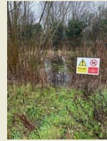
Photos of the neglected overgrown pond.

As part of our commitment to protecting and enhancing the site, some of the s106 monies will be used to carry out a professional survey of the pond to help identify what plant and animal species are currently living in and around the pond, as well as assess the overall health of the habitat.